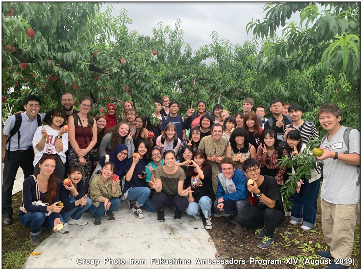
Group Photo from Fukushima Ambassadors Program XIV (August 2019)

Fukushima University International Center